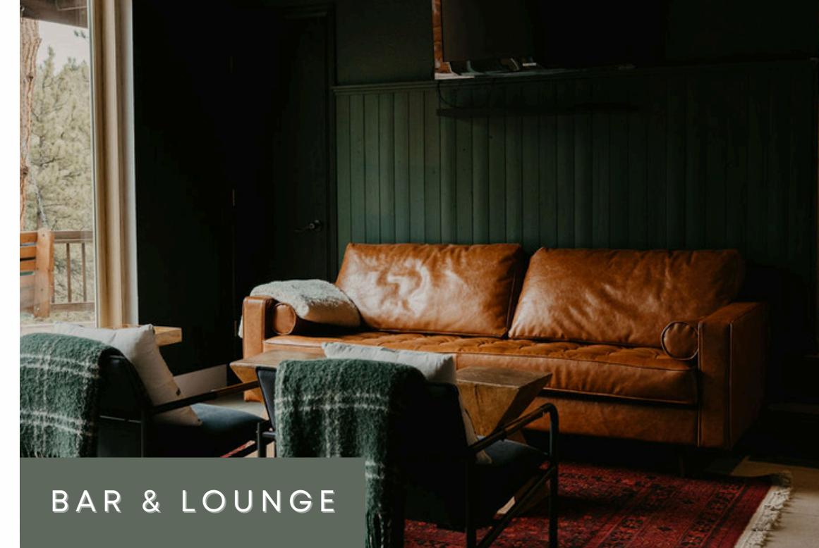
BAR & LOUNGE