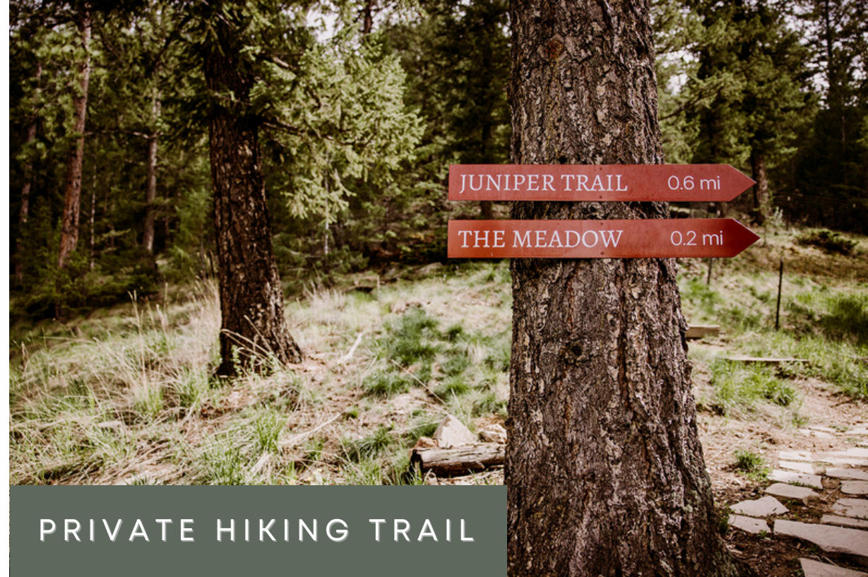
PRIVATE HIKING TRAIL