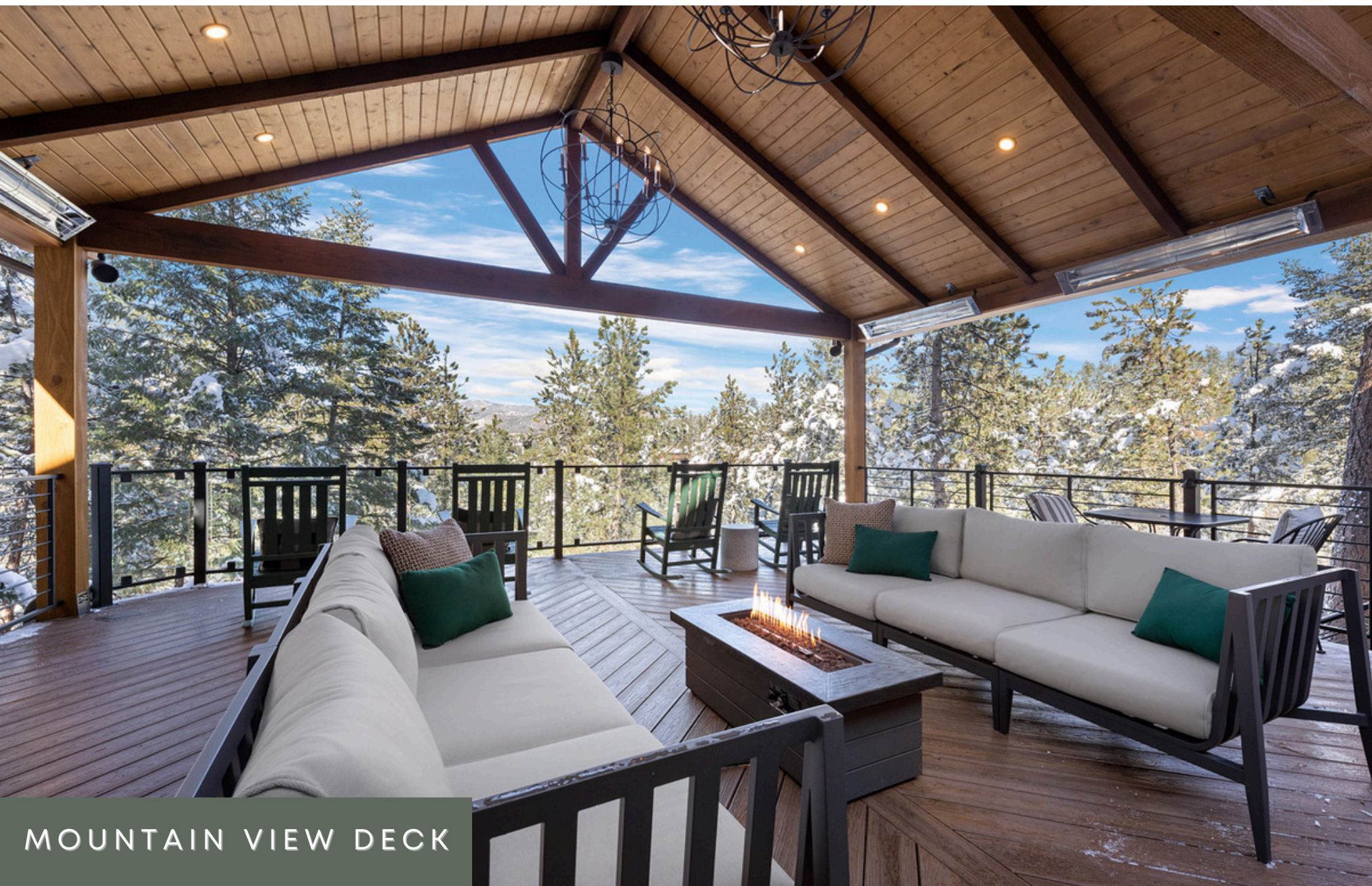
MOUNTAIN VIEW DECK