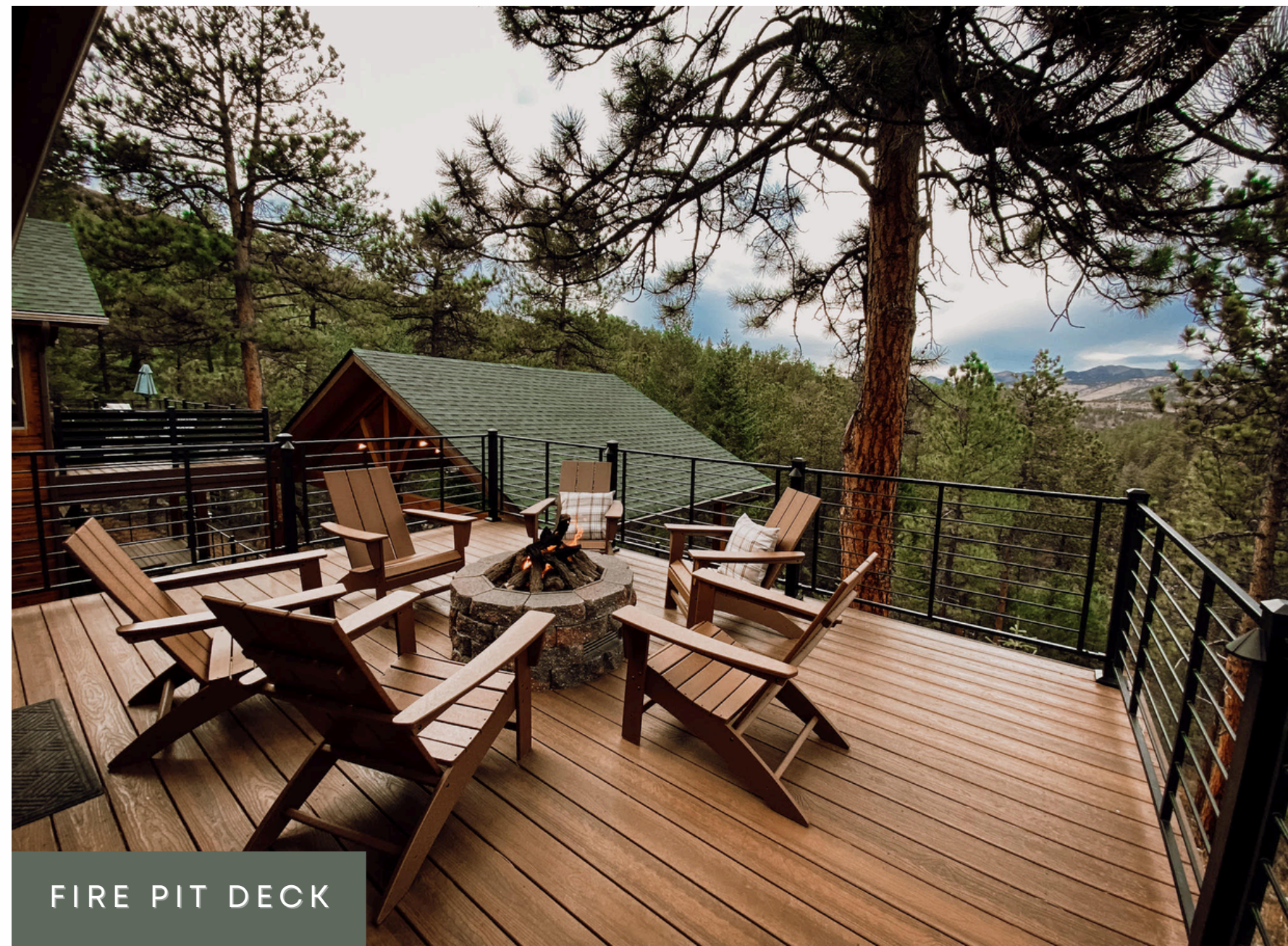
FIRE PIT DECK