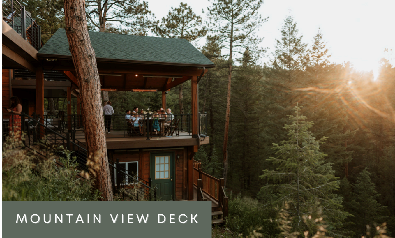
MOUNTAIN VIEW DECK